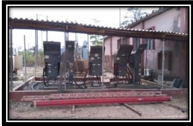
Fig.7. Showing Rhythm