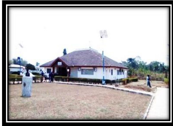
Fig.4. The Air-Conditioning units Showing Appropriate Proximity and Colour Balance