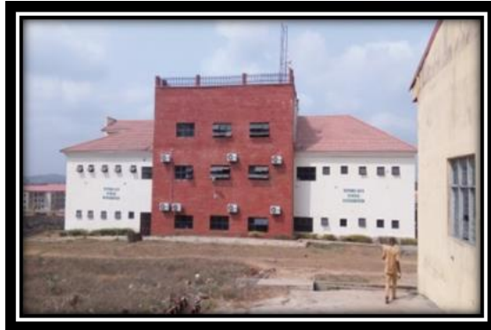
Fig.1. Showing Unity and Pattern in the Installation of the Air-Conditioning units