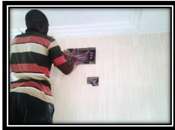
Fig.14. An Electrical Practitioner/Electrician in the Study Area at Work

320 field practitioners were sampled either individually or in small groups. A 100% return rate and validity was recorded. In order to extract information from the selected sample group, a questionnaire was constructed and adopted as a suitable instrument for data collection. Direct observation was adopted to authenticate the accuracy of the responses. Frequencies, percentages and mode were used in analyzing the collected data.