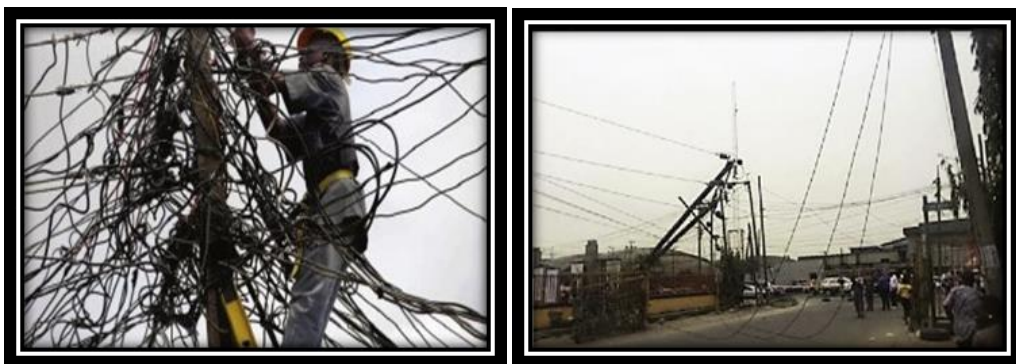
Fig.9(a-b). Showing very untidy and Unsafe Electrical Installation/fit-outs