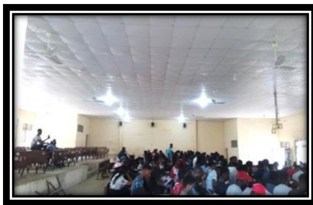
Fig.6. Showing Proximity and Colour Coding