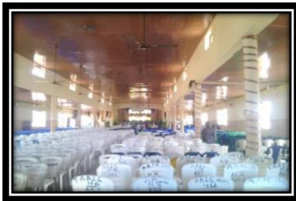
Fig.5. Showing Proximity and Colour