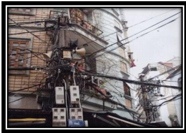
Fig.8. Showing very untidy and Unsafe, but Functional Installations/fit-outs