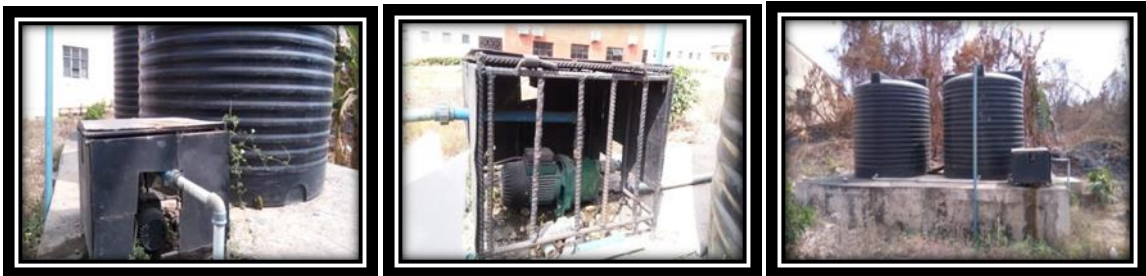
Fig.11(a-c). Colour-Coded Installation