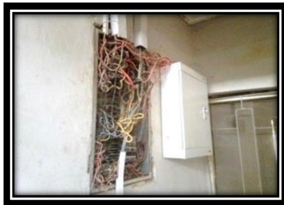
Fig.3. Untidy and Hazardous, but Functional Electrical Installation