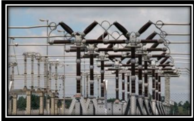
Fig.13. Showing Balance, Rhythm and Movement

Aesthetic, however, can be positive or negative. Aesthetic negativity stems from designs, installation or maintenance processes that are less guided or not guided by appropriate design theories or principles, or as perceived from ugly, misplaced or untidy installations. Aesthetic positivity then can be said to stem from designs, installations or maintenance processes that are guided by appropriate design theories and or principles. Hence, aesthetics cannot divorce from design principles and theories. On this premises, this paper proposes a second aesthetics theory: