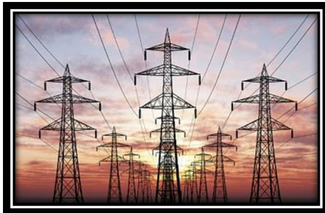
Fig.12. Showing Balance, Proximity and Movement