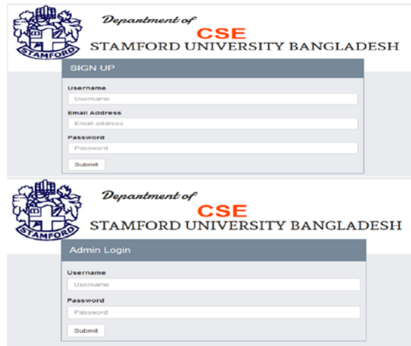
Fig. 4. Admin Sign up and Login Interface of TTE