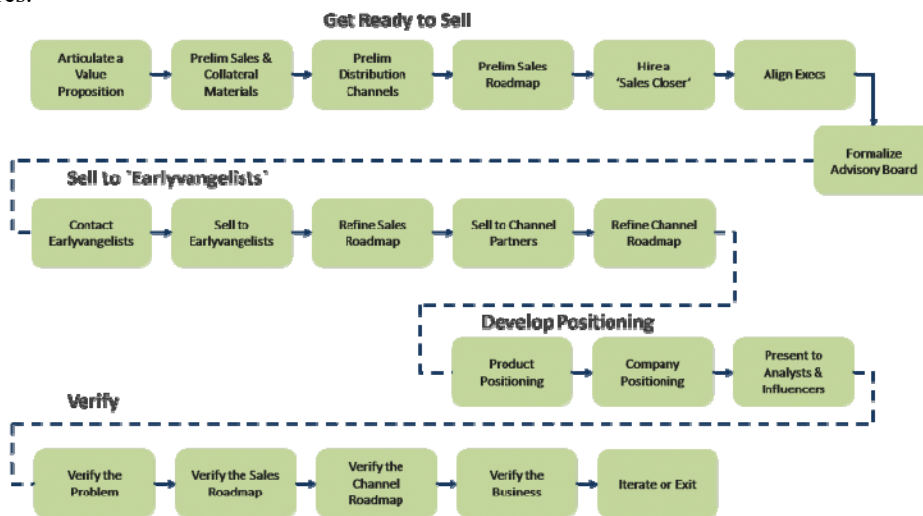
Fig. 1. Customer Validation Process [13]

The post-incubation phase helps incubated start-ups with expanding network to larger scale. The most common service offered in post-incubation phase are (1) diagnostics to analyze gaps and strengths, once start-ups shift to post-incubation, they are walking on their own and needs to focus more on managerial tasks, (2) intellectual property and technology transfer trainings, (3) taxation and internationalization, and not to forget (4) the alumni gathering event where they can get updates from other start-ups as well as established scaled-up ventures.