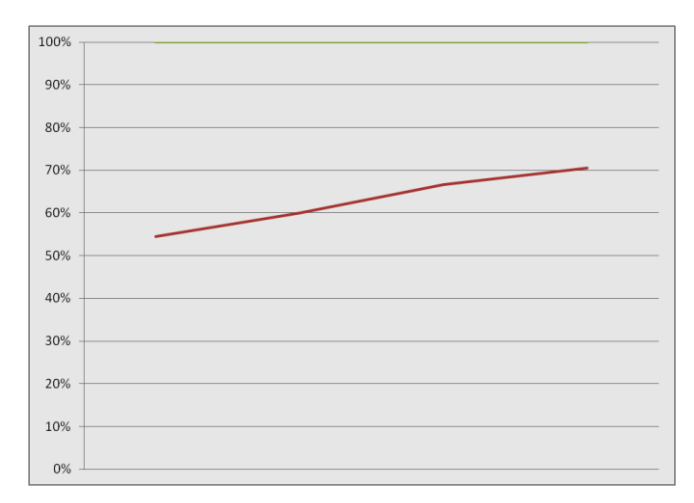
Fig.3. Bitcoin votality from january 2018 to december 2019 [7].

Basically each bitcoin is a computer file. "Digital wallet" app is used to store the bitcoins on mobiles or PCs. People can send and receive Bitcoin (or part of bitcoin) to digital wallets. Blockchain is used to keep record of every single transaction. Because of this record, it becomes possible to trace history of bitcoin. It helps to cessation of using the coins they do not own. Bitcoin can be generated in multiple ways. Bitcoins may be generated by powerful computers with high consumption of electricity. The people may make their computers to process the transactions for everybody to make the bitcoin network to work. These systems are made to perform incredibly difficult sum. The owners of these systems are occasionally appreciated by rewarding with a bitcoin. In mining, people make their systems are becoming more and more difficult. If someone starts mining now it could be year before he got a single bitcoin and might possible he could end up spending money on electricity for his system than the bitcoin would be worth. Brain wallet is enabling enough to recover the private key.