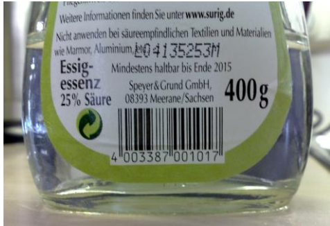
Fig 3: camera image containing barcode