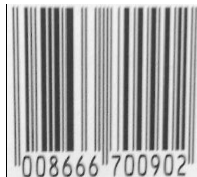
(a) Original Image (No Blur) Blur Factor .0062

We highly appreciate Faculty of Engineering and Technology, Mody Institute of Technology & Science University, Laxmangarh for providing facility to carry out this research work.