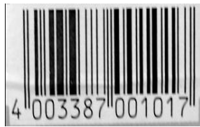
Fig 4: Segmented barcode image