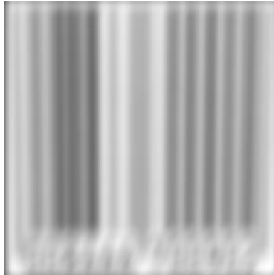
(d) Combined Blurred Image Blur Factor .9958