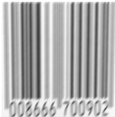
(b) Motion Blurred Image Blur Factor .9912