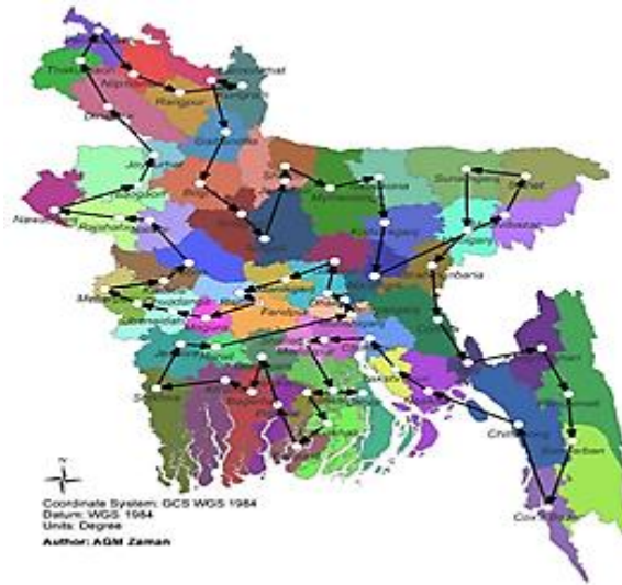
Fig.3. Directed tour resulted from ILP