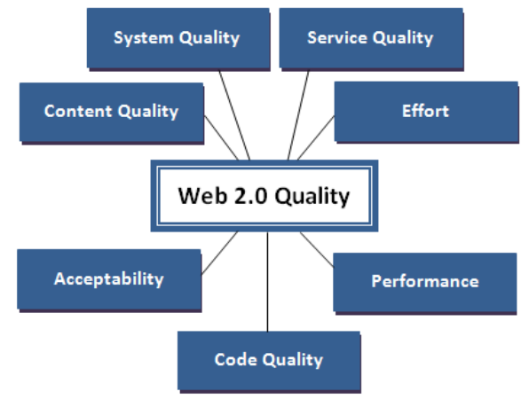
Figure 2. Quality Dimensions for W2A

Keeping literature review as our foundation, it is possible to recapitulate the deficiencies of previous approaches for judging the quality of W2A. Most of them don't have a good empirical validation; those approaches do not cover up all the areas of W2A quality and the relationship between the quality attributes; proper guidelines for the use of these approaches are not given as well as they didn't aim general users; there is no definite verification that the existing methodologies and approaches are suitable for estimating the quality of W2A. Therefore, these apparently separate frameworks were combined and a new enhanced model is shaped by keeping the features of Web2.0 in mind that are mentioned in Fig. 1. According to new model, W2A quality can be deal with seven major dimensions which are shown in Fig. 2.