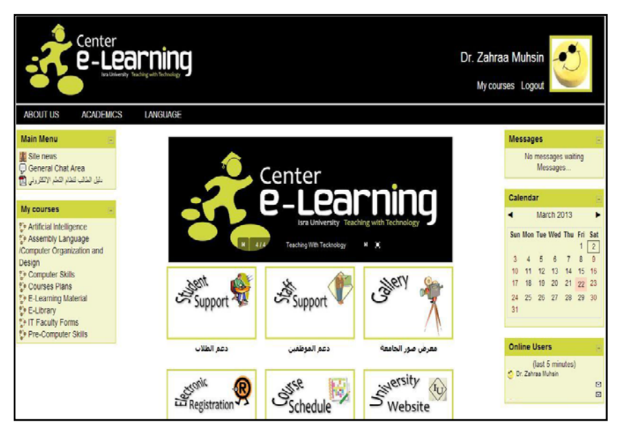
Figure 5. IUELS design and manage by IUELC main page lyout.