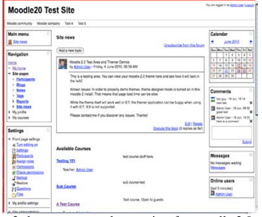
Figure 2 shows an example test view for moodle 2.0. Figure 2. Moodle 2.0 Test Web site layout design

Moodle website [17] release many document to encourage university to work with Moodle 2.x. Universities started to upgrade their Moodle platform with Moodle 2.x (2.0, 2.1, 2.2, 2.3 or 2.4). These versions required many planning and testing then the old one (1.9 and later). Moodle 2.0 platform does not accepted to be straightforward as upgrades through earlier versions; it is different to the moodle 1.9 versions.