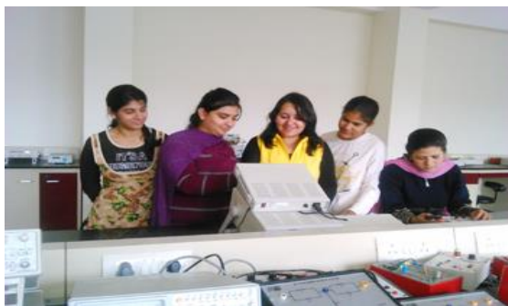
Fig.5. Snapshot of Students in Lab hands on training

In order to cultivate outstanding application oriented engineering professional the same is beneficial for skill development [53]. A snapshot of hands on training for professionals through laboratory skill development is as shown in Fig. 5.