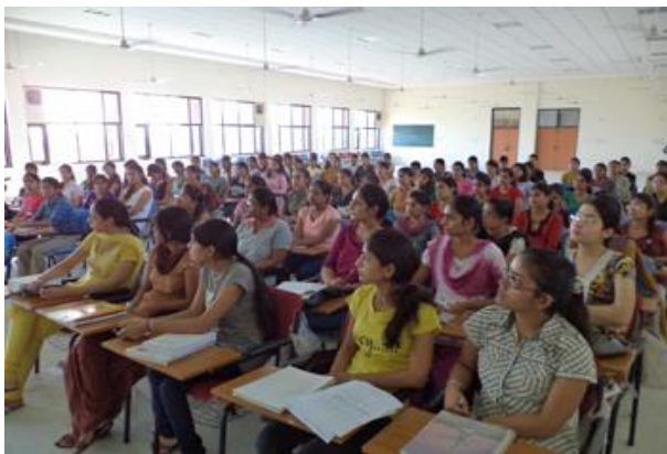
Fig.8. Snapshot of Seminar on Personality Development