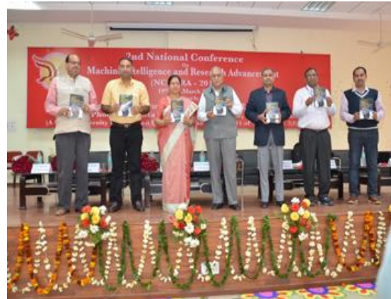
Fig.1. Snapshot of National Conference on “Machine Intelligence and Research Advancement”

A snapshot of National Conference on “Machine Intelligence and Research Advancement” and UGC sponsored workshop on Computational Tools in Research is depicted in Fig. 1 and 2 respectively.