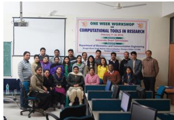
Fig.2. Photograph of workshop on Computational Tools in Research