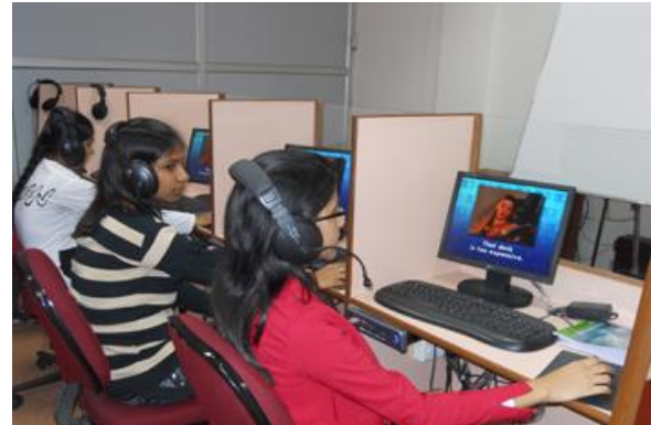
Fig.6. Snapshot of Language Resource Centre

A snapshot of language lab for soft skill development is illustrated in Fig. 6.