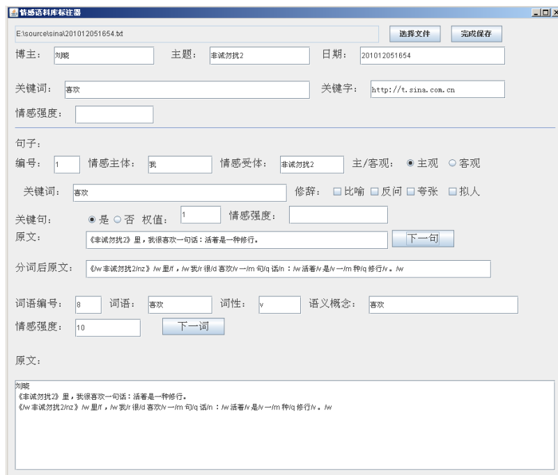
Fig. 3. The Tagging System Interface

To reduce artificial labeling errors, a java-based Corpus Tagging System is designed to improve the efficiency and accuracy. The system reads a text file and outputs an xml file after artificial annotation. The system interface's screenshot is shown below (Fig. 3).