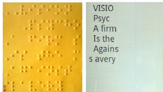
Fig.5. Image of a Braille document and the text produced using the application

The application was developed using the Android platform and it was found that the accuracy of the application varies greatly depending on the way the sheet is aligned with the smart-phone. Under ideal conditions of light and alignment of sheet with the smart-phone, an accuracy of over 80% was obtained. Figure 5 depicts the image and text obtained using the application. As can be seen, the image lacks clarity, that is, the dots are not prominently visible and appear slightly blurred.