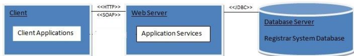
Fig.1. Architecture of SORS

When the clients invoke the remote services it is transparent i.e. the clients don't know that the services are executing on a different machine or vice versa. The following figure depicts the architecture of the system.